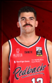
12 COSTEAU KYLE KDK FAMILY LAW