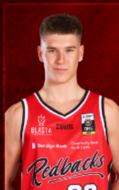
20 KOBAY WEIR