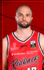
17 JACOB FORMOSA LAND PERFORMANCE CENTRE