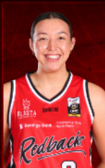
8 MYA DIMANLIG