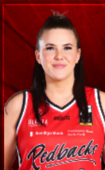
4 REBECCA MOTRONI TROPHY CHOICE