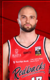
17 JACOB FORMOSA LAND PERFORMANCE CENTRE