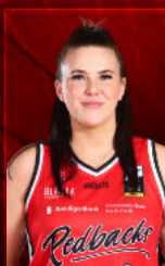
4 REBECCA MOTRON TROPHY CHOICE