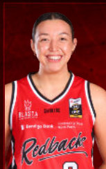
8 MYA DIMANLIG