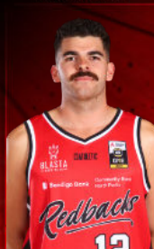
12 COSTEAU KYLE KDK FAMILY LAW