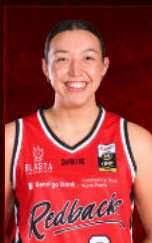
8 MYA DIMANLIG